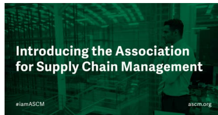
ASCM Welcomes New Members on Social Media